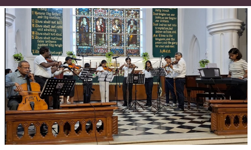
St. Andrew's Church, long known for its rich musical heritage, had always deserved a Music School of its own. Despite several attempts, it had not materialized - until the Pastorate Committee revitalized the idea and re-launched the Music School in 2015.

Initially, piano and violin lessons were offered to both members of our church and other congregations. Finding teachers proved challenging, as students preferred weekend classes, and many professional musicians were already committed. Nevertheless, the school officially started in 2016. Since then, numerous students - both young and not-so-young - have had the opportunity to learn violin, keyboard, cello, and trumpet at a nominal fee. Many have been successfully groomed to pass the Grade Exams from both the ABRSM (Associated Board of the Royal Schools of Music, London) <a href="https://www.abrsm.org/en-in">https://www.abrsm.org/en-in</a> and Trinity College of Music, London, <a href="https://www.trinitycollege.com/gualifications/">https://www.trinitycollege.com/gualifications/</a> often achieving distinction.