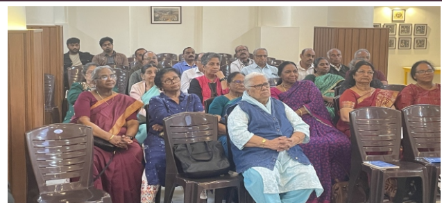
The Care For The Elderly Ministry had their monthly Fellowship for the month of July on Saturday, the 27<sup>th</sup> of July 2024. All praise and thanks to our God Almighty for showering us with His unfailing love and blessings all the time. Great is His Faithfulness!

St. Andrew's Elders Group had a blessed and wonderful time of Fellowship on Saturday, the 27<sup>th</sup> of July, 2024. Our enterprising Youth Group led us in joyous singing.