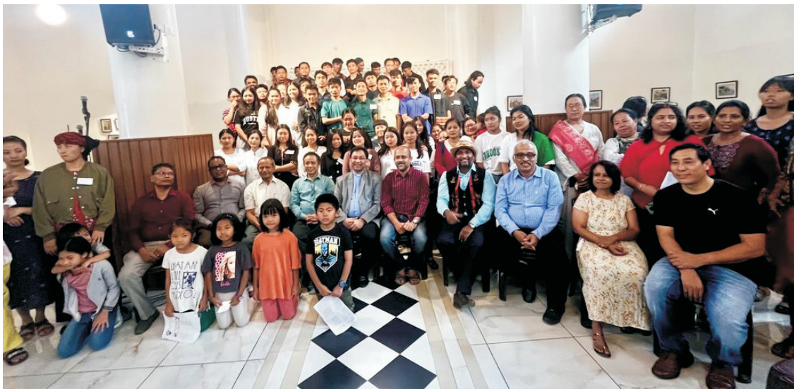
"Hopeful Hearts Christmas Celebrations Unite Communities at St. Andrew's Church"

The spirit of Christmas resonated through the Halls of St. Andrew's Church as the Men's Fellowship organized the "Hopeful Hearts Christmas Celebrations" on Saturday, December 9 th , 2023. The event saw an overwhelming turnout with over 120 individuals from the Manipuri Community, alongside our Congregation and Pastorate Committee Members.