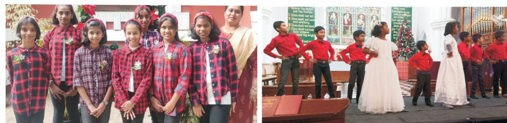
"Oh what a Glorious Night"

What a wonderful way to end this year 2022 with our children exhibiting their talents on Sunday, the 18 th of December 2022 for the Sunday School Christmas Program .